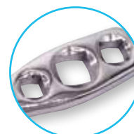
Misure chiave fisse 8.5-9.5-13mm