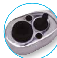
Misure cricchetto 1/4"-5/16"